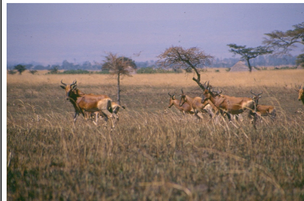
Fig.7. Swayne's Hartebeests (Maze & Nech-Sar)

Main attractions: So far 46 larger and medium mammals and 196 different bird's species have been recorded in the park. Swaynes hartebeest, Lesser Kudu, Greater Kudu, Lion, Bohor, Leopards, , and Oribi are typical features of the park. Beside the park and the surrounding area have different natural, cultural and historical attractions such as Bilbo Hot Springs, Wenja Stone Cave, "Kaouwa Wella"(Yeniguse Warka),