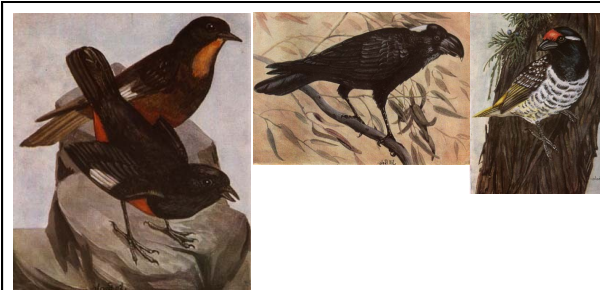
Fig.6. Endemic Birds which are also found in CCNP