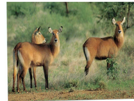
Fig.2. Water Buck

e-mail: south_tourism@yahoo.com Website: www.southtourism.gov.et phoneNo: 251462210480/251462218489 P.o.box 1078 Hawassa, Ethiopia