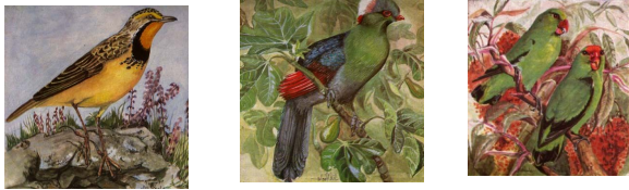
Fig.3. Another Endemic Birds found in SNNPR (Abyssinian Long-Claw, Prince Ruspoli's Turaco, Black-Winged Lovebird)