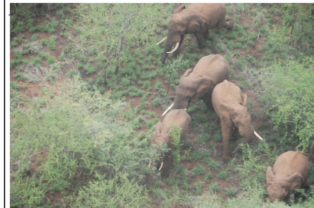
Fig.5. African Elrphant (Omo National Park)

Besides, there are eight different ethnic groups living around the ONP known for their untouched culture & traditional life style including lip plate of Surma & body coloration of Mursi.