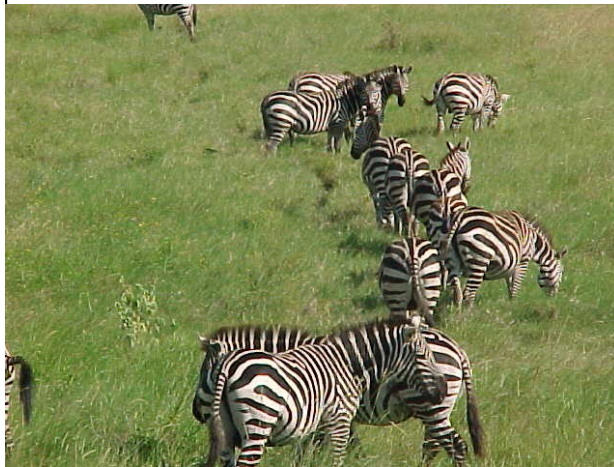
Fig.4. Burchel's Zebra (Nech-Sar)

Nech-Sar is very well-known for its wonderful attraction sites such as Crocodile Market (where hundredth of giant Nile crocodile with congregation of waterfowls and hippo herds are commonly seen on the shore of the lake), the Forty Springs, Lake Abaya and Chamo, the Chained Amaro Mountains, the Bridges of God & Nech-Sar Plains.